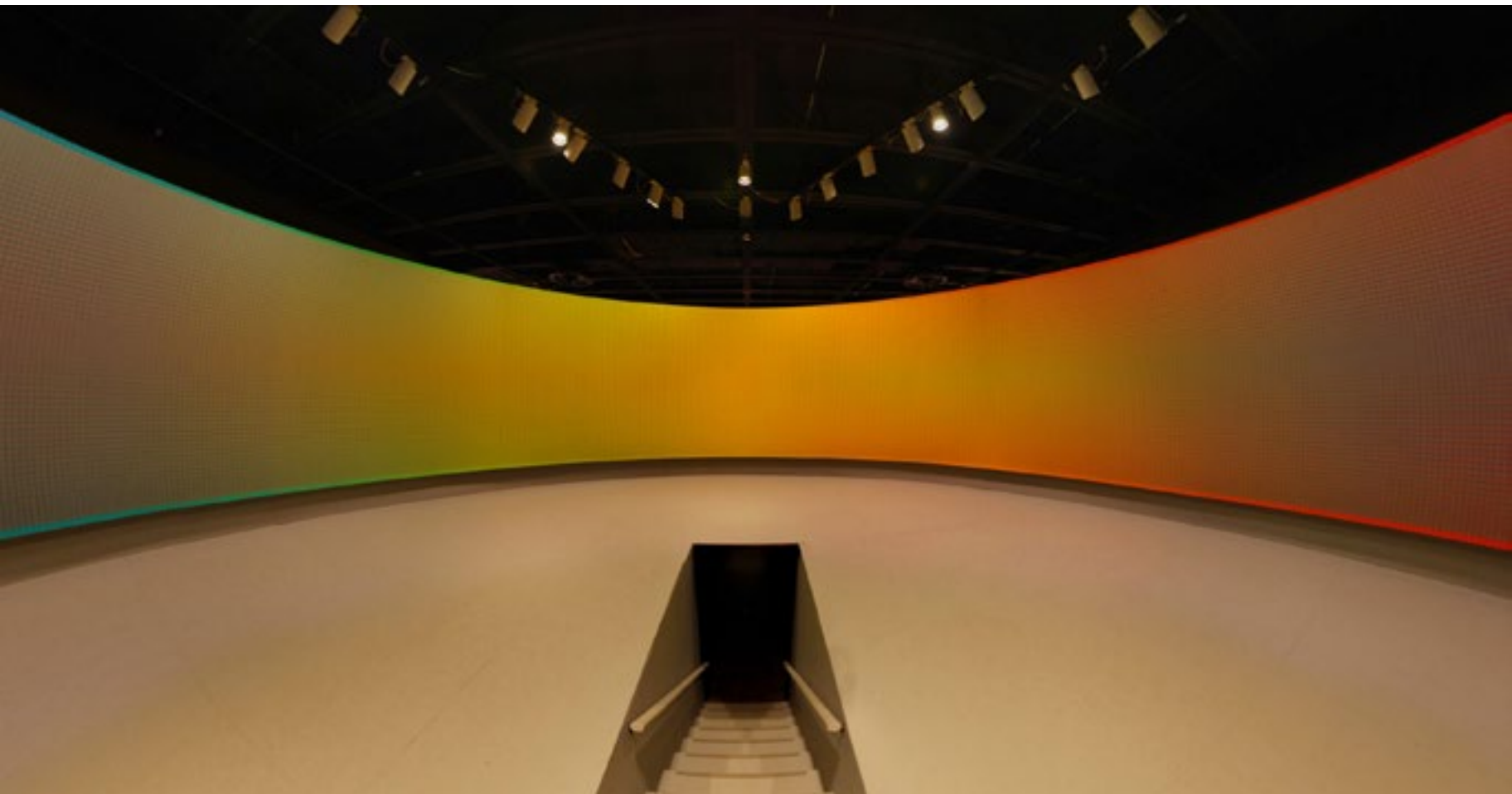
FIG. 1 Sanford Wurmfeld. E-Cyclorama, 2006-08, Acrylic on canvas, 8 ½ x 30 ½ x 26 ½ ft. (259.1 x 929.6 x 807.7 cm). Collection of the artist. Installation view at the Neuberger Museum of Art, Purchase College, SUNY, 2009.