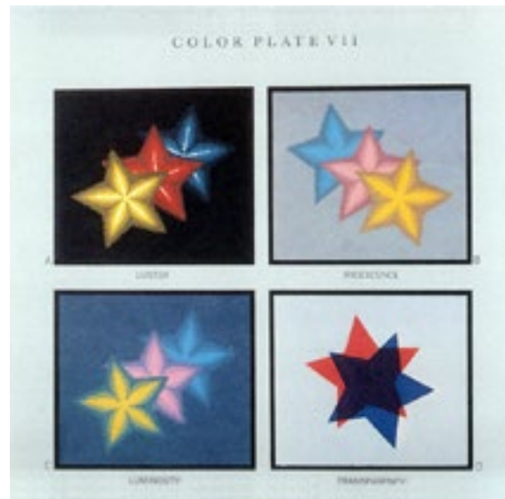
FIG. 2 From Faber Birren, Principles of Color: A Review of Past Traditions and Modern Theories of Color Harmony , published by Van Nostrand Reinhold Company, New York, 1969, p. 94.