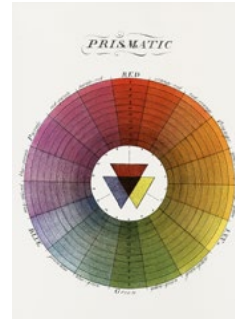
FIG. 3 From Moses Harris, The Natural System of Colours , 1776, facsimile edition, Whitney Library of Design, New York, 1963, p. 9.

For Wurmfeld, as for Seurat, craft mediates between the scientific and the aesthetic. Wurmfeld is not a savant manqué but a painter who has achieved enhanced luminosity by the implementation of procedures he has invented. His painterly skill is indissoluble from manual dexterity. From a distance of a foot or less, his watercolors, brushed with acrylic washes on creamy white paper, reveal the delicate movements of his hand. One sees the rhythmic penciled points and the hair-thin graphic lines connecting them to form nesting triangles. Although the linear edges are sharply determined, they have very slight irregularities that manifest Wurmfeld's hand as he lays delicate veils of color over a subtly textured Arches paper. In that way he recalls Seurat's use of Michallet paper whose